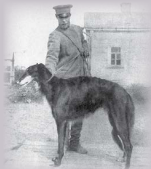
“Rogdai,” black male, born in Perchino in 1909, type of Perchino dogs of dark color. “Rogdai has good underjaw and length of neck. He stands balanced, but is balanced with lack of front and rear angulation. Has nice length of leg and good feet and pasterns. His head is long and lean, but downfaced. The curve to his topline starts too far forward. Has depth of chest but stands square.” — Sillers

Borzoi standard is the best of all. Clare concludes, “which is hardly surprising, as a number of enthusiasts have done a great deal of work on it. They have attempted to incorporate much of the detail of the FCI standard into the more easily assimilated format of the American and English standards.”