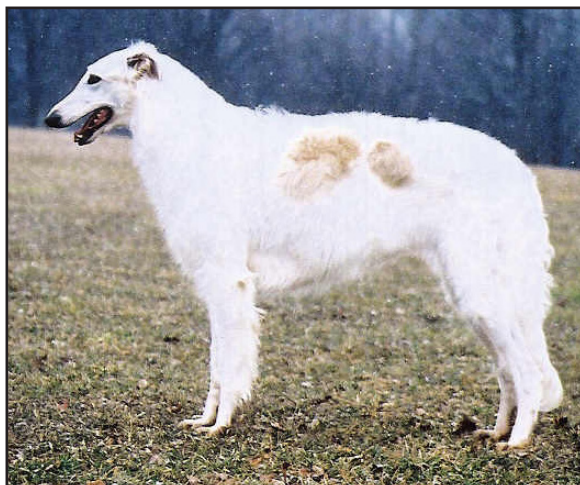
MBISS CH. RAYNBO'S WINTER ROSE