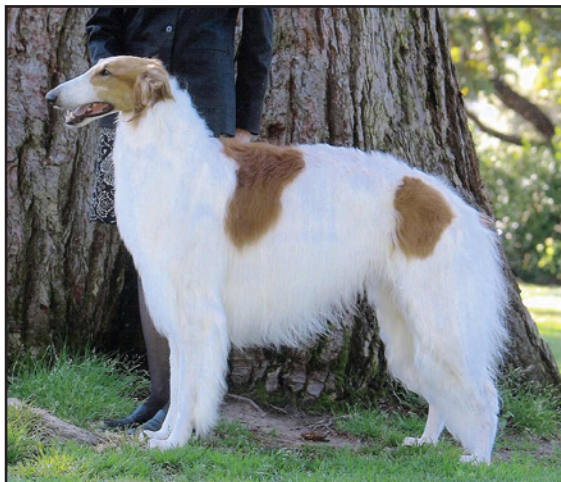
CH. SUNBURST HUNTSMAN AT MECHTA