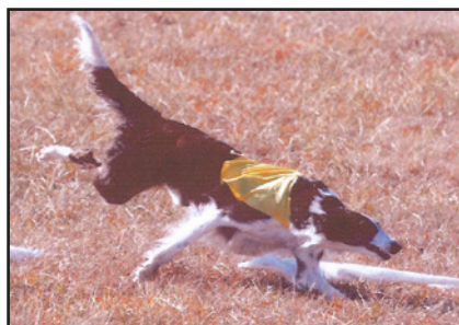
PHENANTHREN'S ARWEN TSARYTSIN RYHKA SC, LCM3