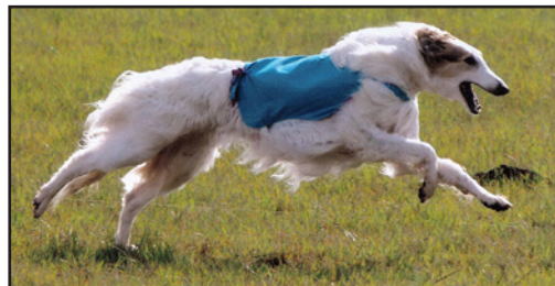
DC VENTO DANZA AUSTRI SC, MC, FCH.