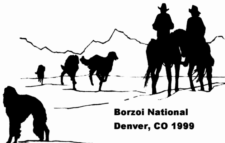
Borzoi National Denver, CO 1999