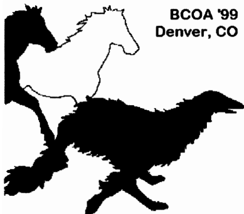
BCOA '99 Denver, CO

Running Borzoi with Horses Tees & Sweats Available in the colors Bermuda (Aqua) or Coral