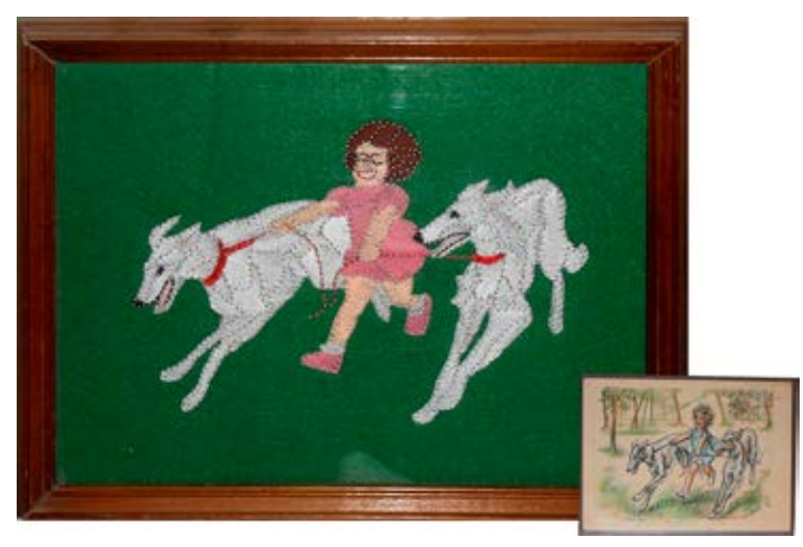
My last stringart was created from one of my favorite Borzoi postcards. This was my first attempt at stringing a human, and

and not bid on it. So to save humiliation of someone laughing at my donation, I decided to just keep it in my house. The Borzoi is a cowboy complete with a 6-shooter at his side, ready to draw on the unsuspecting armadillo. Now I'm not sure if that was supposed to be a shadow or something that came from the armadillo, but it was there so I included it. I never got around to framing it. No known value since there's nothing to compare it with.