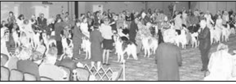
Judge Garry Newton applauding as all champions, veterans and winners have entered the Best of Breed Judging

smooth in the neck and shoulder transition. Good topline. Excellent feet. 4) O'Bobtor Navar's Lady - Good puppy bitch. Nice head and ears. Excellent expression. Overall a good mover but moving with a front reach that was less than I was looking for. Topline was less than those with better ribbons as well. Puppy's age and mental