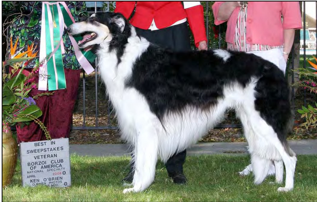
Best in Veteran Sweeps (Dogs, 9 years and under 10)