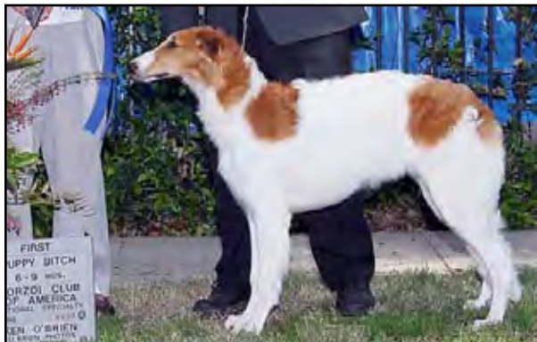
Bitches, 6 months and under 9