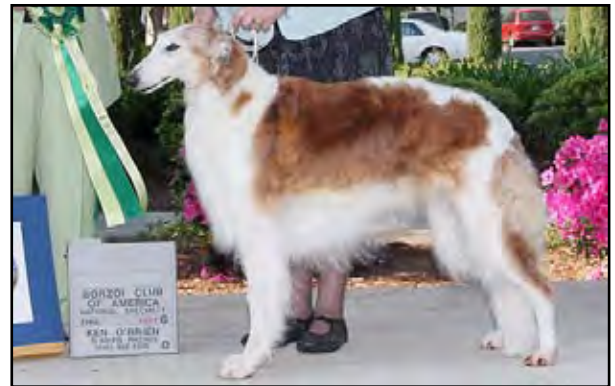
VETERAN Sweeps Bitches, 9 years and under 10 CH. REGIUS ONE STAR IN SIGHT