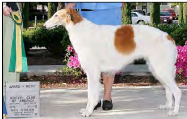
Award of Merit