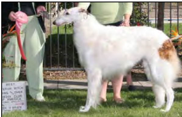
Bitches, Veterans 10 years and older