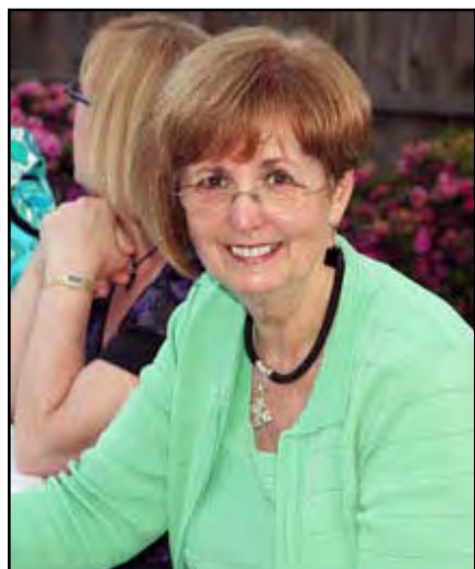
Ring steward par excellence

I had a wonderful time judging and I had a good time, I hope that everyone else did too. §