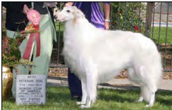
Dogs, Veterans 7 years & under 10 years