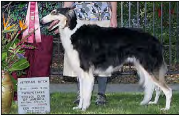
VETERAN Sweeps Bitches, 8 years and under 9 CH. DEL SOL BELLE STARR, SC