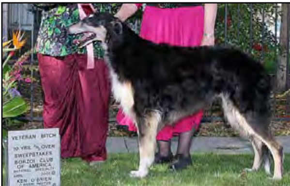
VETERAN Sweeps Bitches, 10 years and older DC BROLIN'S GOLIGHTLY HURRICANE, SC