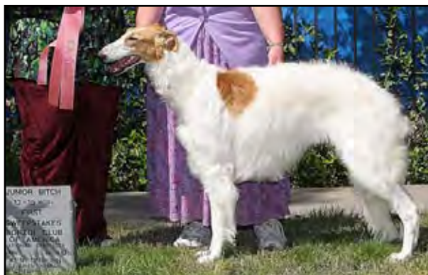
PUPPY Sweeps Bitches, 12 months & under 15 KYROV-LEREAU DREAM WITH ME