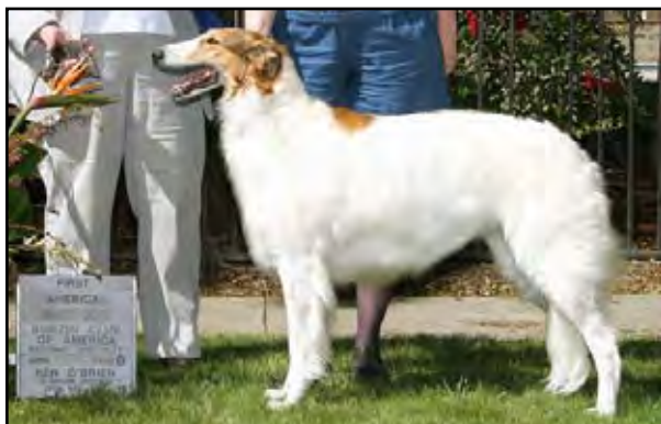
Bitches, American Bred