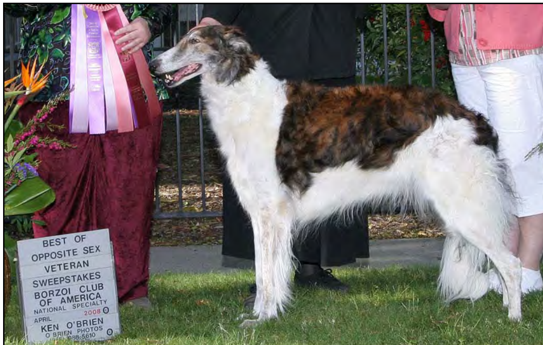
Best Opposite Sex in Veteran Sweeps (Bitches, 7 years and under 8)