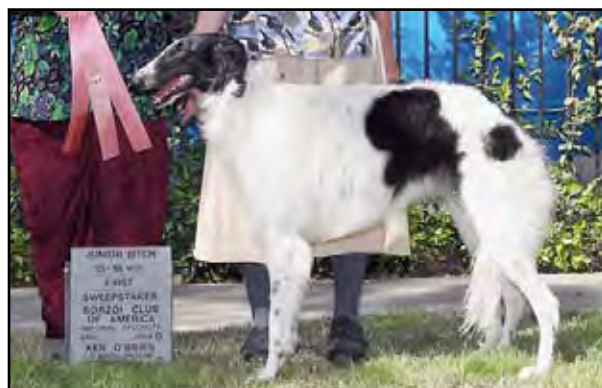
PUPPY Sweeps Bitches, 15 months & under 18 DEL SOL PHOEBE