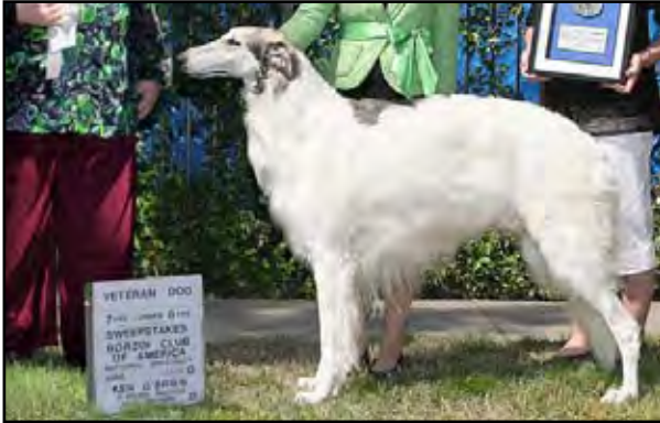
VETERAN Sweeps Dogs, 7 years and under 8 CH. JUBILEE BREATH OF LIFE, CD, CGC