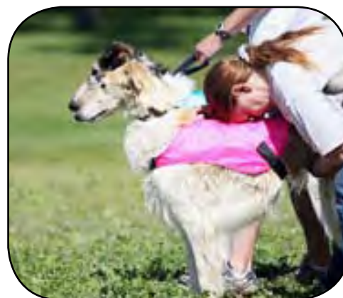
Lure coursing photo courtesy of Kathy Port

For those not familiar with LGRA scores, the first number after the name is the total points for the meet. The second set of numbers is points received at towards the GRC title and the National points for SGRC. FTE = First Time Entered - has never been in an actual race meet before. DNF = Did Not Finish. DQ = Disqualified. S3 means that the dog was scratched in the 3rd program. Dogs run in groups of 4 and each dog runs 3 times.