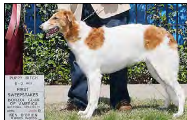
PUPPY Sweeps Bitches, 6 months & under 9 ORONZOVA PARTY GIRL IN PARADISE