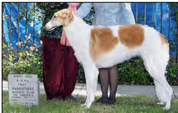
PUPPY Sweeps Dogs, 6 months and under 9 SUNBURST BLAZE AWAY