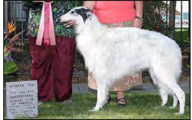
VETERAN Sweeps Dogs, 8 years and under 9 CH. WIND 'N SATIN ESTACIA