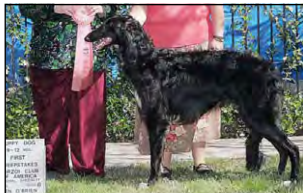
PUPPY Sweeps Dogs, 9 months and under 12 KADLECS HIGH FLYIN PLAYBOY