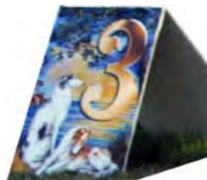
One of the beautiful ring placement signs