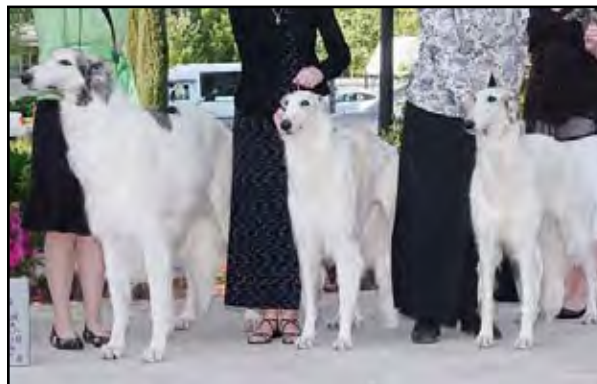
Best Stud Dog